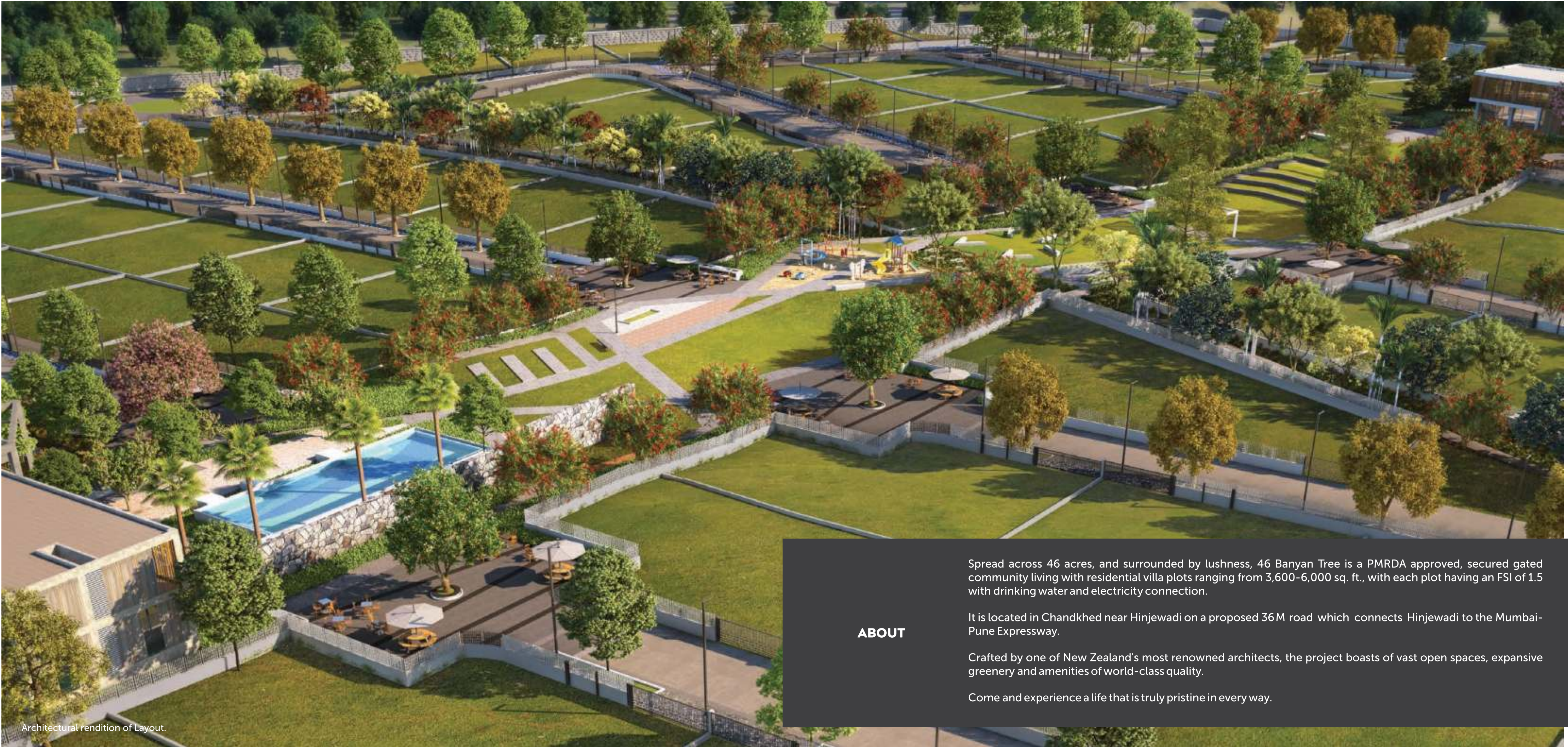
Architectural rendition of Layout.