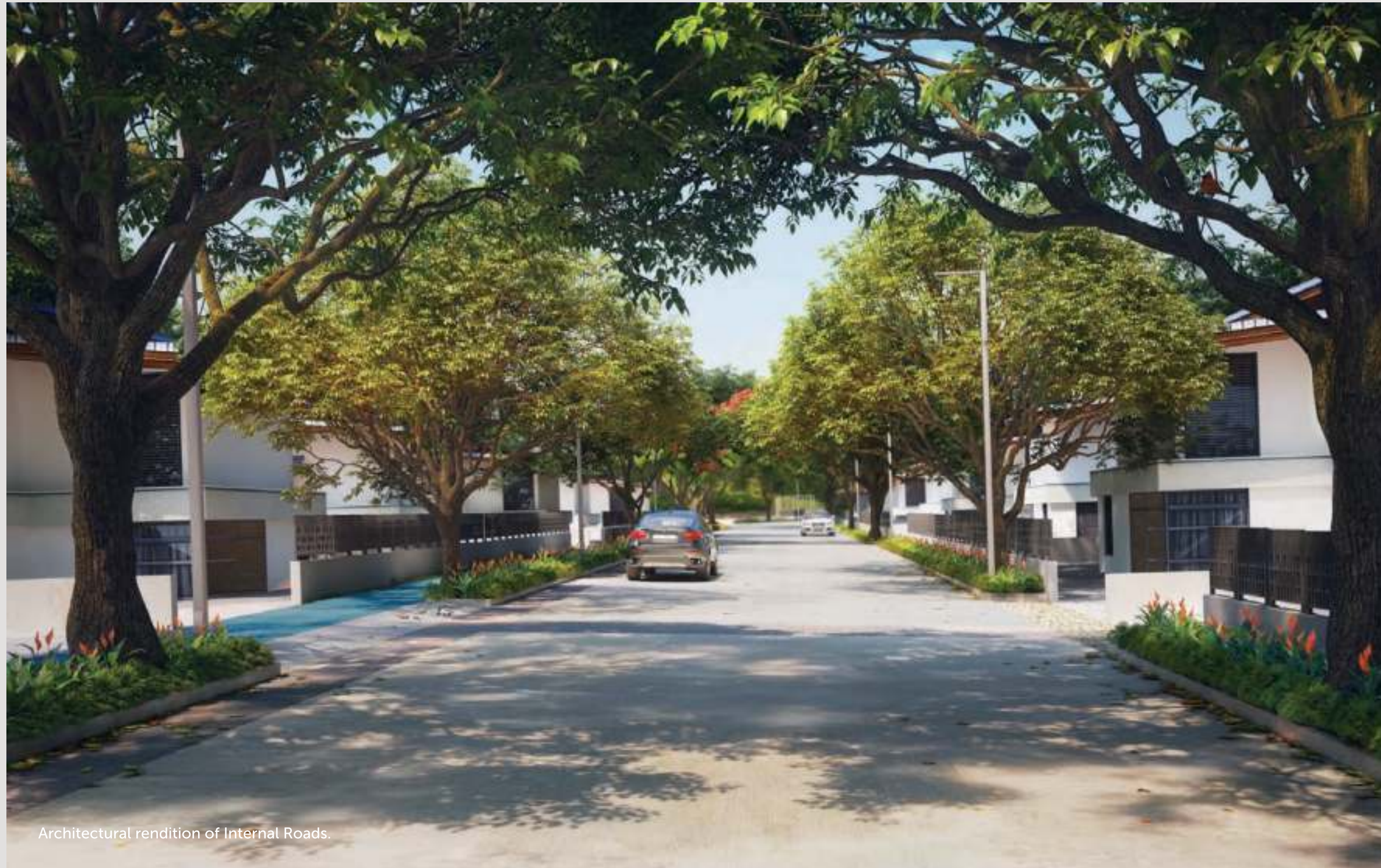
Architectural rendition of Internal Roads.