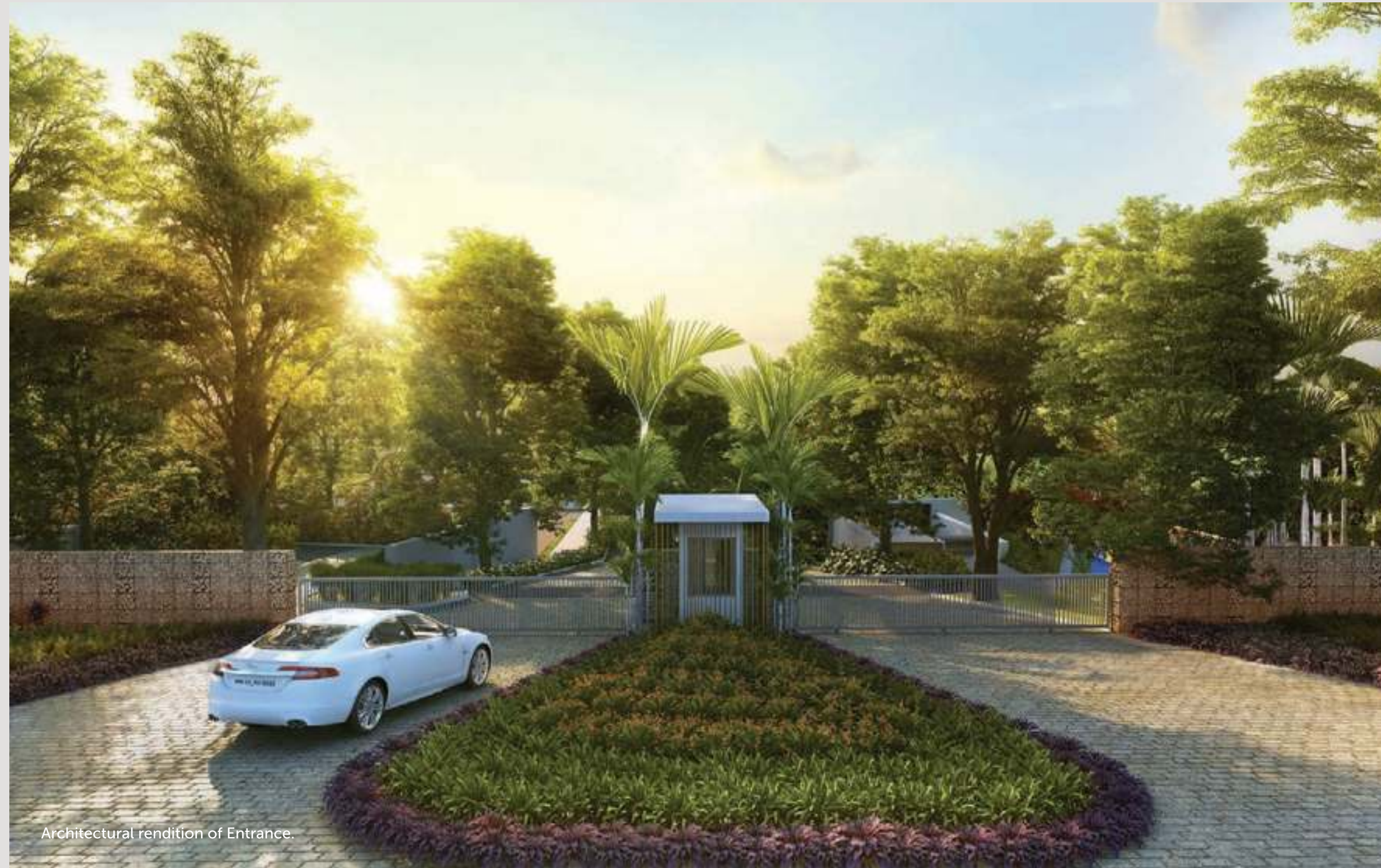
Architectural rendition of Entrance.