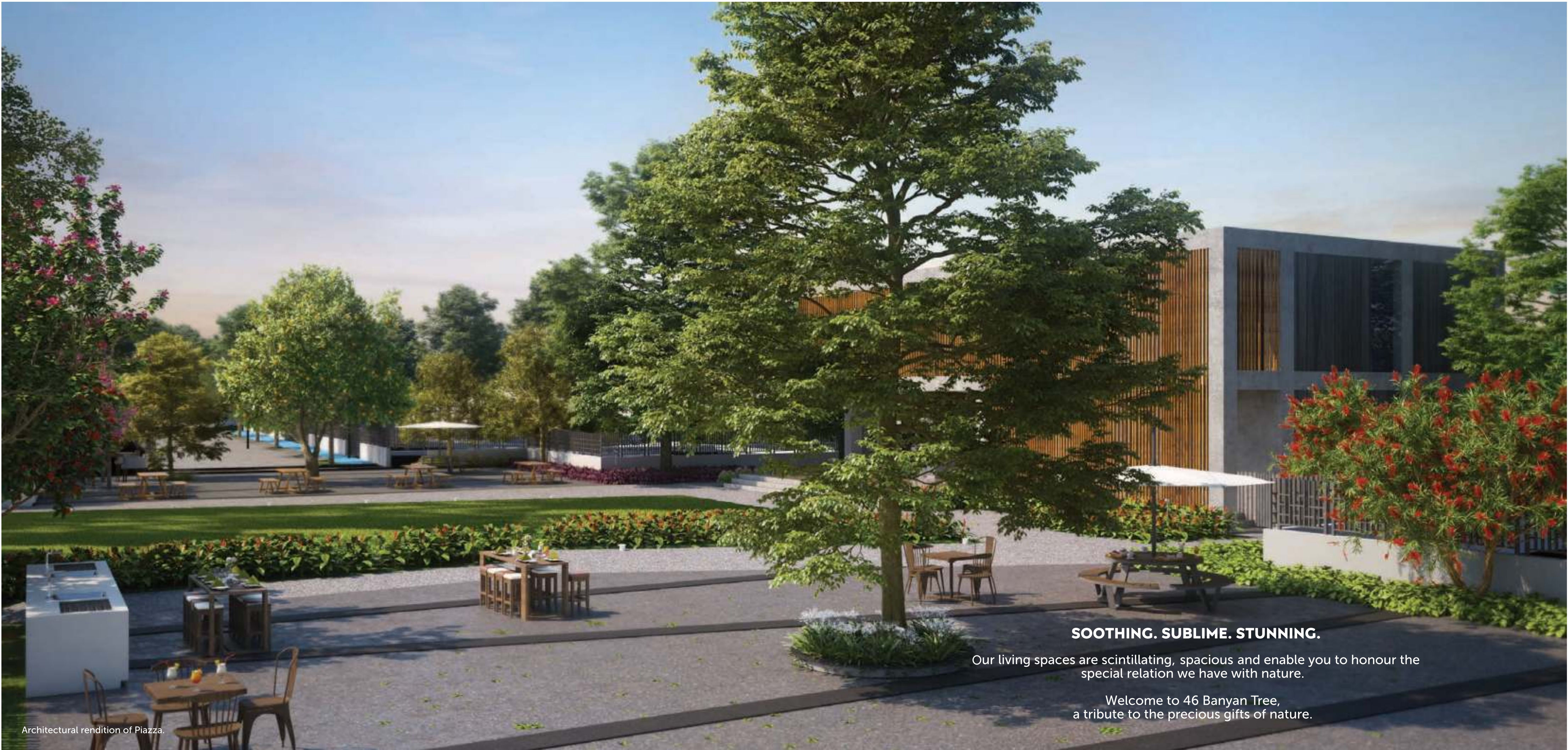
Architectural rendition of Piazza.