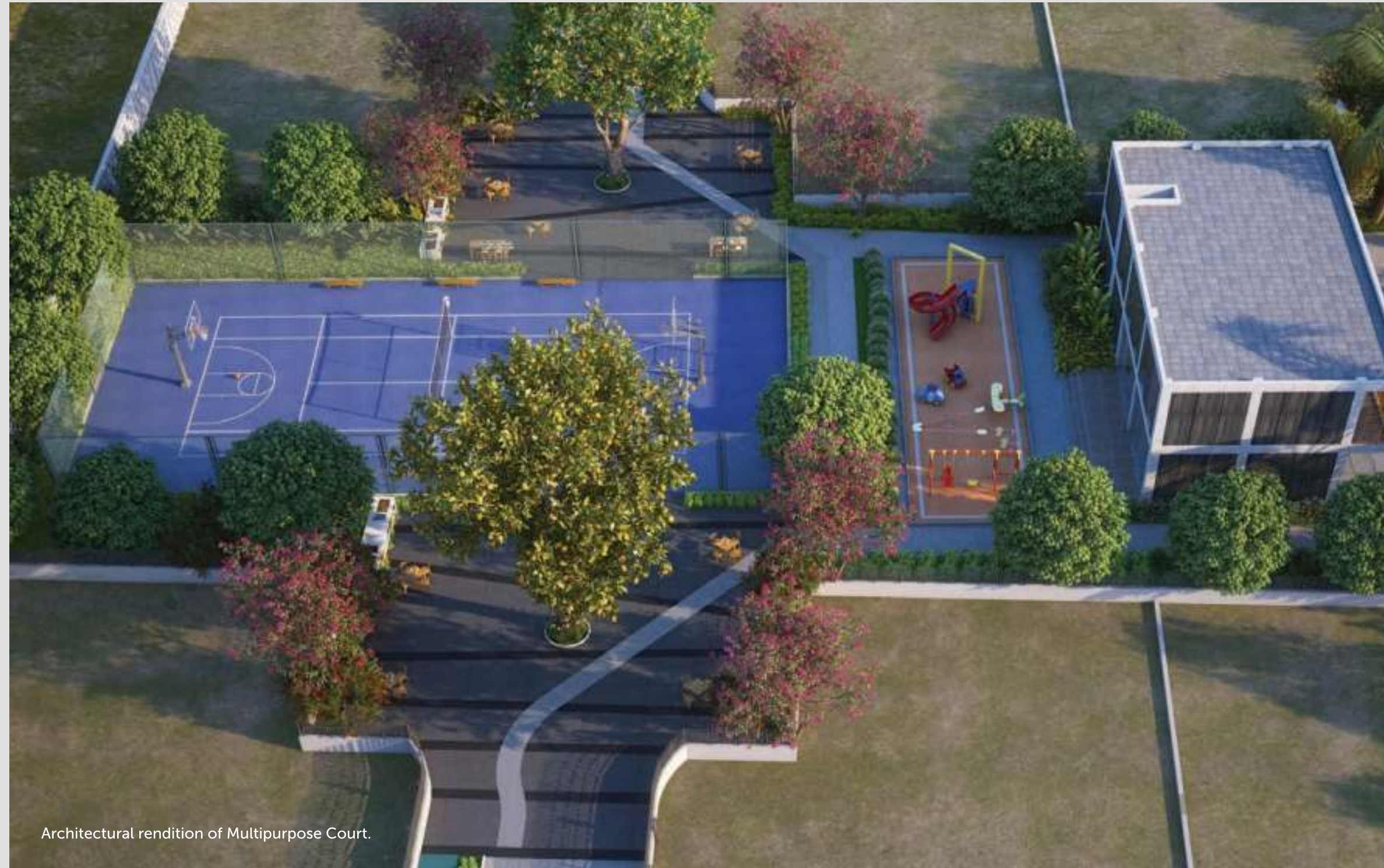
Architectural rendition of Multipurpose Court.